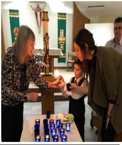
A special evening as we celebrated our students who made their Sacrament of First Reconciliation.